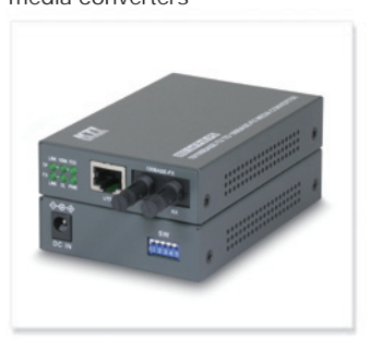
KGC-352 PoE PD Gigabit Ethernet media converters