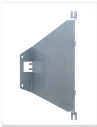
Panel Mounting Bracket KSD-8PB